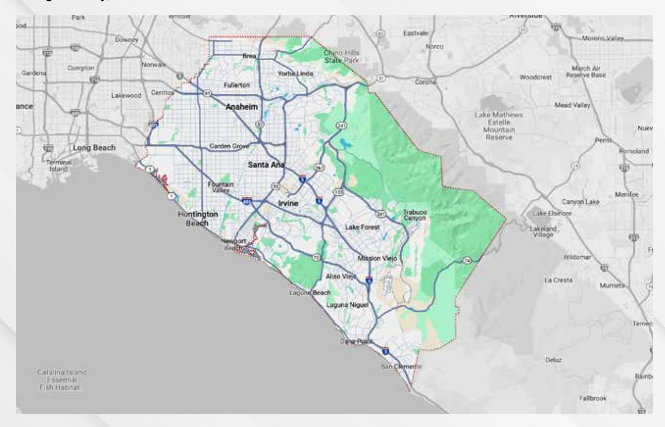
MSA 40140 (Riverside-San Bernardino-Ontario, CA Metropolitan Statistical Area)